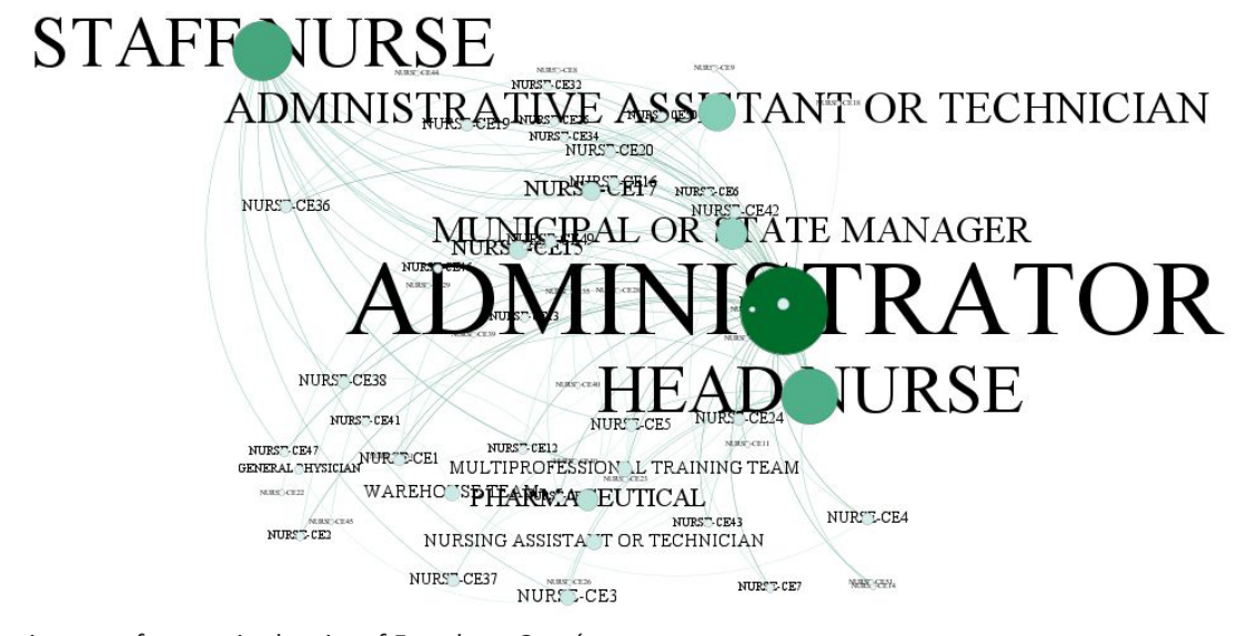
Figure 2. Sociogram of nurses in the city of Fortaleza, Ceará.

that PPE is provided: head nurses, team nurses, nursing aides or technicians, managers, warehouse teams, multiprofessional training teams, and management assistants or technicians. On the other hand, the nursing technicians in Fortaleza, Ceará, highlight managers, municipal or state managers, nursing aides or technicians, and management assistants or technicians.