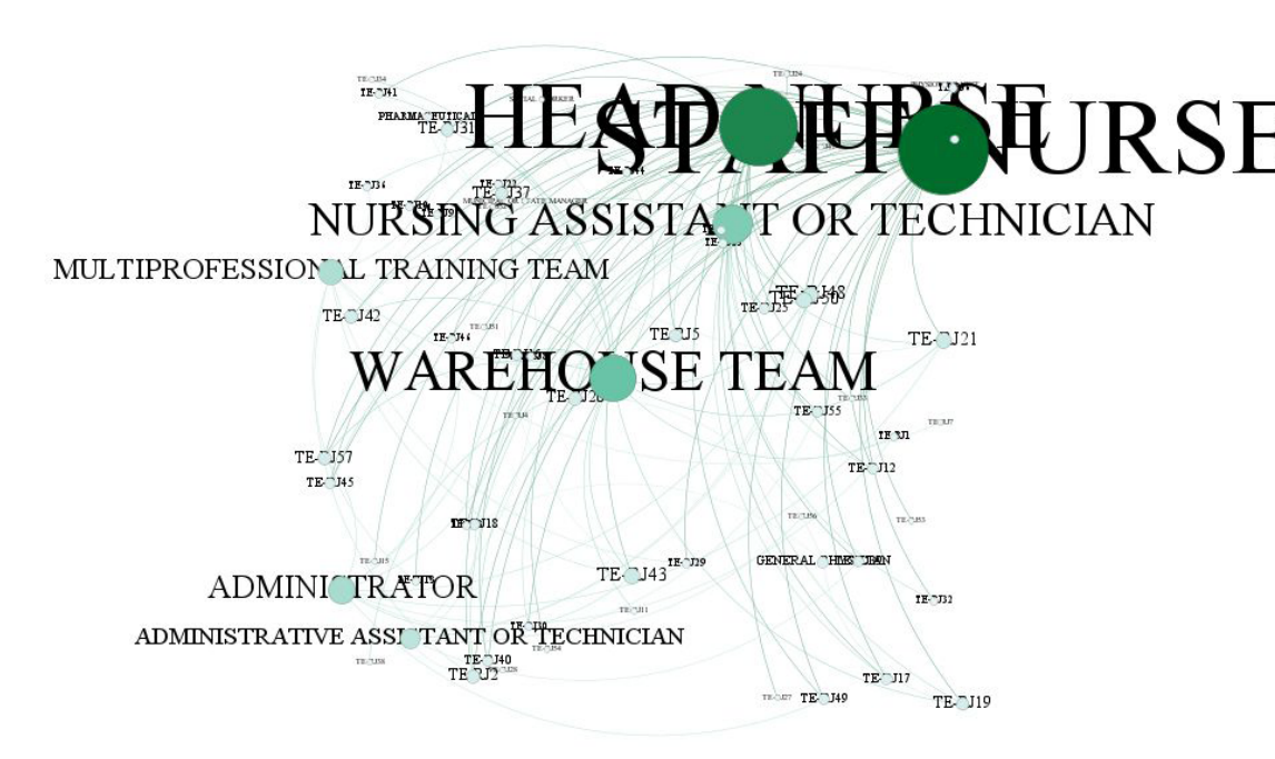
Figure 3. Sociogram of nursing technicians in the city of Rio de Janeiro.